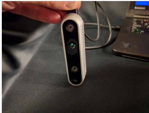
Figure 4-3 USB cable up facing out

With the camera facing the same direction as described in section 4.3.2.1, rotation the camera 90 degree about the camera’s viewing directions such that the USB cable is now pointed to the ceiling.