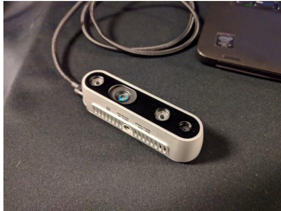
Figure 4-7 Viewing direction facing up

From Position #5 rotate the camera 180 degrees about the USB cable such that the Intel® RealSense™ logo is face down.