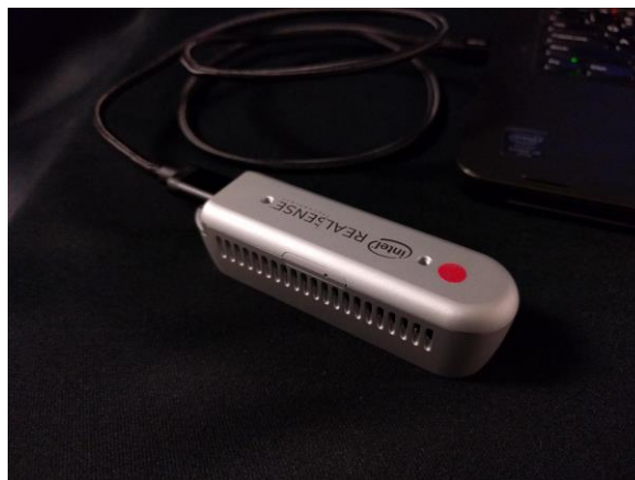
Figure 4-6 Viewing direction facing down

Place the camera viewing direction facing down such that the Intel® RealSense™ logo is facing up.