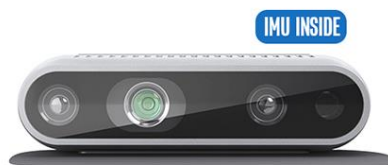
Figure 3-2 D435i Device

Intel® RealSense™ Depth Camera D435i device as shown below is used to show the calibration process.