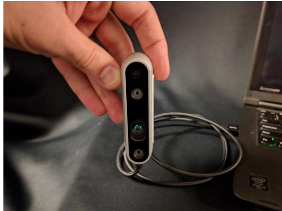
Figure 4-5 USB cable pointed down

From Position #3 rotate the camera an additional 90 degrees such that the USB cable is now pointed down.