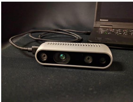
Figure 4-2 Upright facing out position

Leave the camera place in the camera’s natural position with the ¼-20 threaded tripod mount to the ground as shown in Figure 4-2