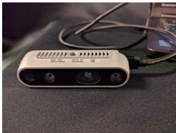
Figure 4-4 Upside down facing out

From Position #2 rotation the camera an additional 90 degrees about the viewing direction of the camera such that now the camera is upside down with the ¼ - 20 threaded tripod mount facing up.