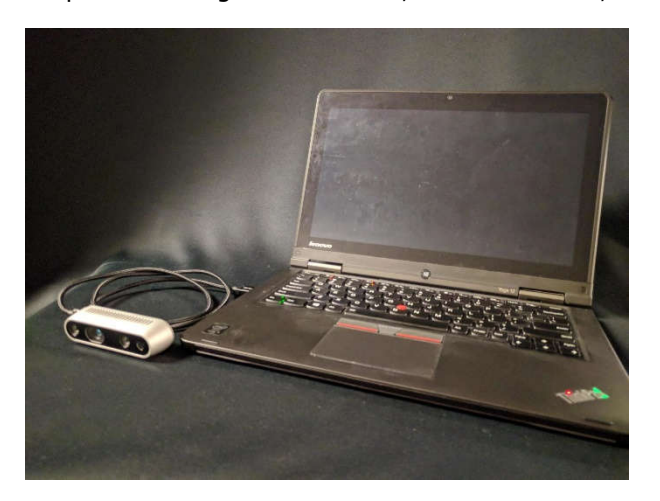
Figure 3-1 Hardware Setup

The hardware required includes the D435i, D455 or L515 device to be calibrated, a USB cable, and a computer running Windows* 10, Ubuntu* 16.04, and Ubuntu 18.04.