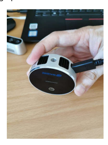
Figure 4-10 L515 Position #3 (Upside down facing out)

From Position #2 rotate the camera an additional 90 degrees about the viewing direction of the camera such that now the camera is upside down with the \frac{1}{4} - 20 threaded tripod mount facing up.