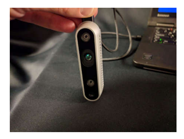
Figure 4-3 D45i and D455 Position #2

Leave the camera still in this position for 3 to 4 seconds.