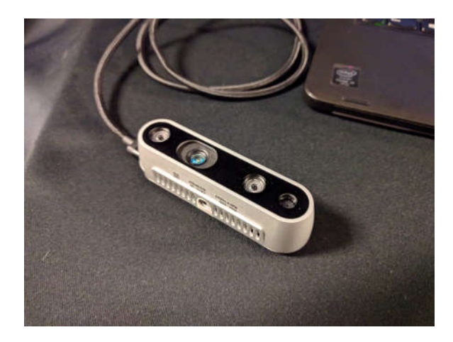
Figure 4-7 D45i and D455 Position #6 viewing direction facing up

Leave the camera still in this position for 3 to 4 seconds. Let the camera remain in this final position until the recording stops.