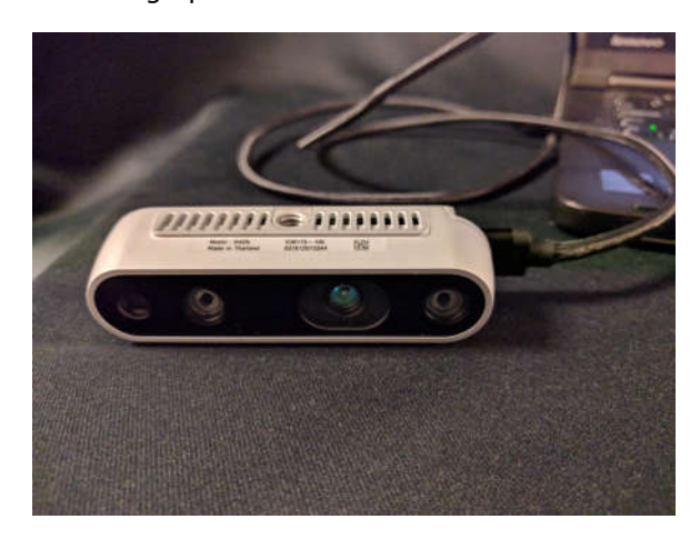
Figure 4-4 D45i and D455 Position #3

From Position #2 rotate the camera an additional 90 degrees about the viewing direction of the camera such that now the camera is upside down with the \frac{1}{4} - 20 threaded tripod mount facing up.