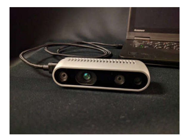
Figure 4-2 D45i and D455 Position #1

After starting the recording as previously described in section 4.3.1, leave the camera still in this position for 3 to 4 seconds. The script will provide a prompt and guide through each of the positions.