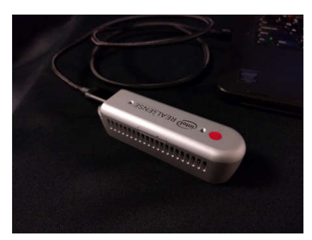
Figure 4-6 D45i and D455 Position #5 viewing direction facing down

Place the camera viewing direction facing down such that the Intel® RealSense ^{\text{\tiny{TM}}} logo is facing up.