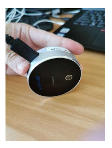
Figure 4-11 L515 Position #4

Once again, leave the camera still in this position for 3 to 4 seconds.