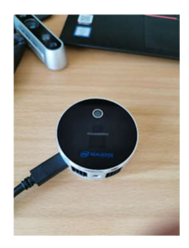
Figure 4-13 Position #6 Viewing direction facing down

Leave the camera still in this position for 3 to 4 seconds. Let the camera remain in this final position until the recording stops.