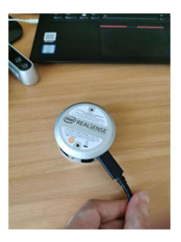
Figure 4-12 L515 Position #5 Viewing direction facing down

Place the camera viewing direction facing up such that the Intel® RealSense ^{\text{\tiny TM}} logo on the front is facing down.