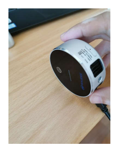
Figure 4-9 L515 Position #2

Leave the camera still in this position for 3 to 4 seconds.