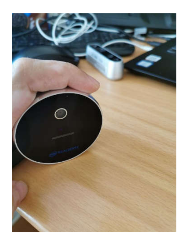
Figure 4-8 L515 Position #1 (Upright facing out position)

After starting the recording as previously described in section 4.3.1, leave the camera still in this position for 3 to 4 seconds. The script will provide a prompt and guide through each of the positions.